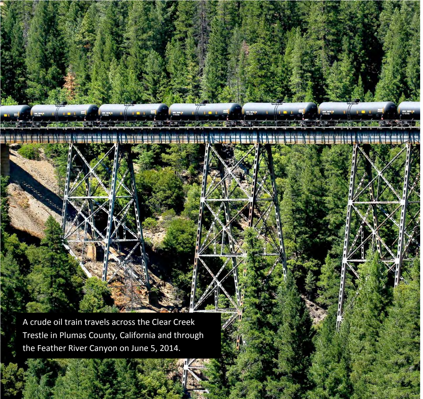
A crude oil train travels across the Clear Creek Trestle in Plumas County, California and through the Feather River Canyon on June 5, 2014.

State of California Interagency Rail Safety Working Group June 10, 2014