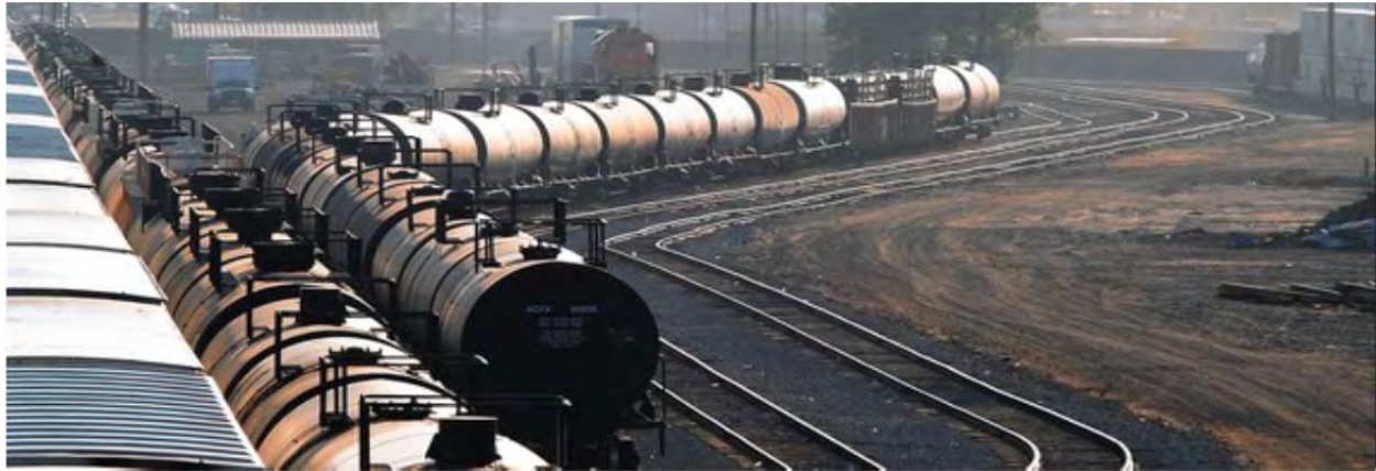
Tanker cars line up in Bakersfield, Calif., where Alon USA Energy recently received permission to build the state's biggest oil-train terminal.