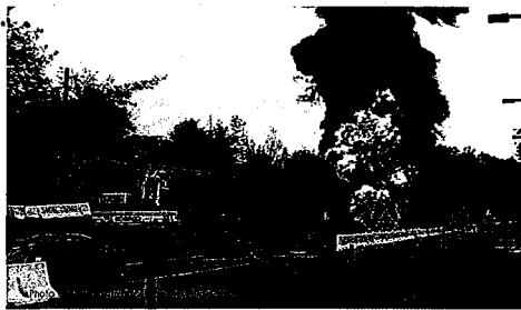
Chronicle / Rickstet Highway